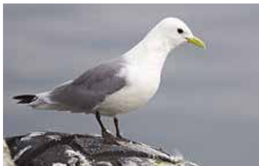
Black Legged Kittiwake