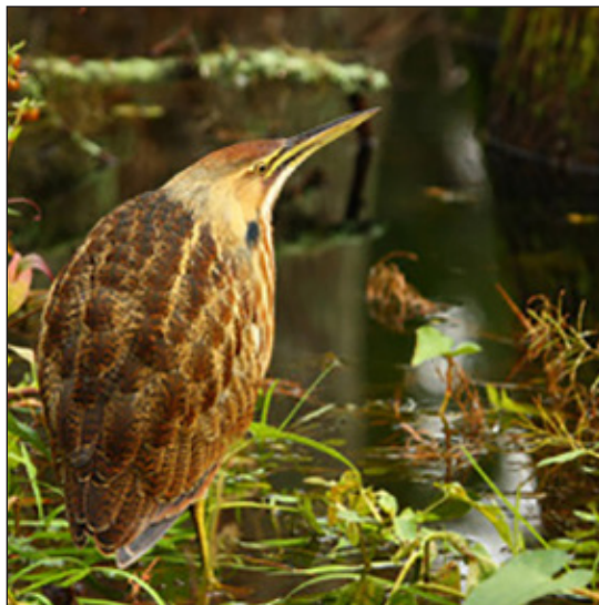
American Bittern