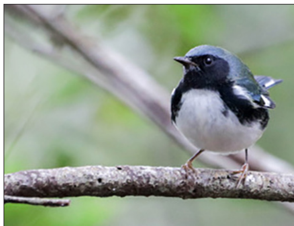
Black-throated Blue Warbler by Mary Alice Tartler